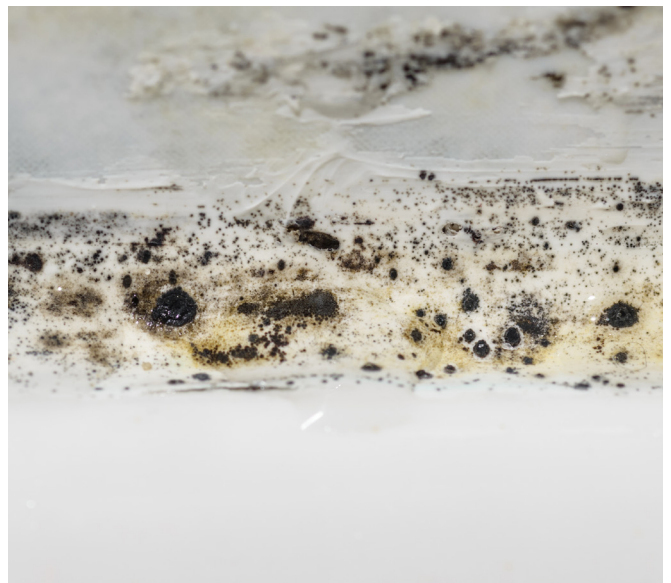
Growth of mould, fungus and mildew in the air conditioning systems